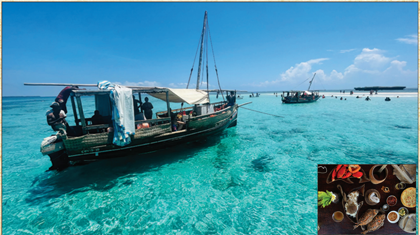
Kisiti Mpunguti Marine National Park & Wasini Island

Flight to Nairobi JKIA and your onward flight. Safari Njema. Karibu Tena.