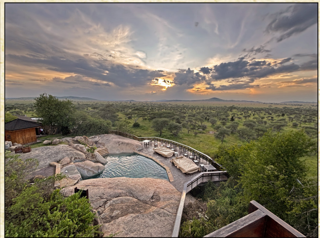
Seronera Wildlife Lodge, Serengeti National Park