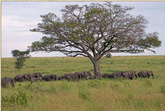
Serengeti National Park

Dinner and overnight Serengeti Serena Safari Lodge FB.