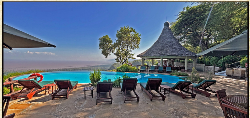
Lions in Lake Manyara climb trees to avoid heat, avoid insect bites and to stalk prey.