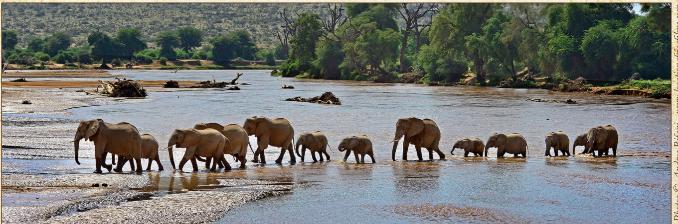
Herd of Elephants crossing the Ewaso Ngiro, Samburu National Reserve

Dinner & Overnight Samburu Intrepid FB or similar.