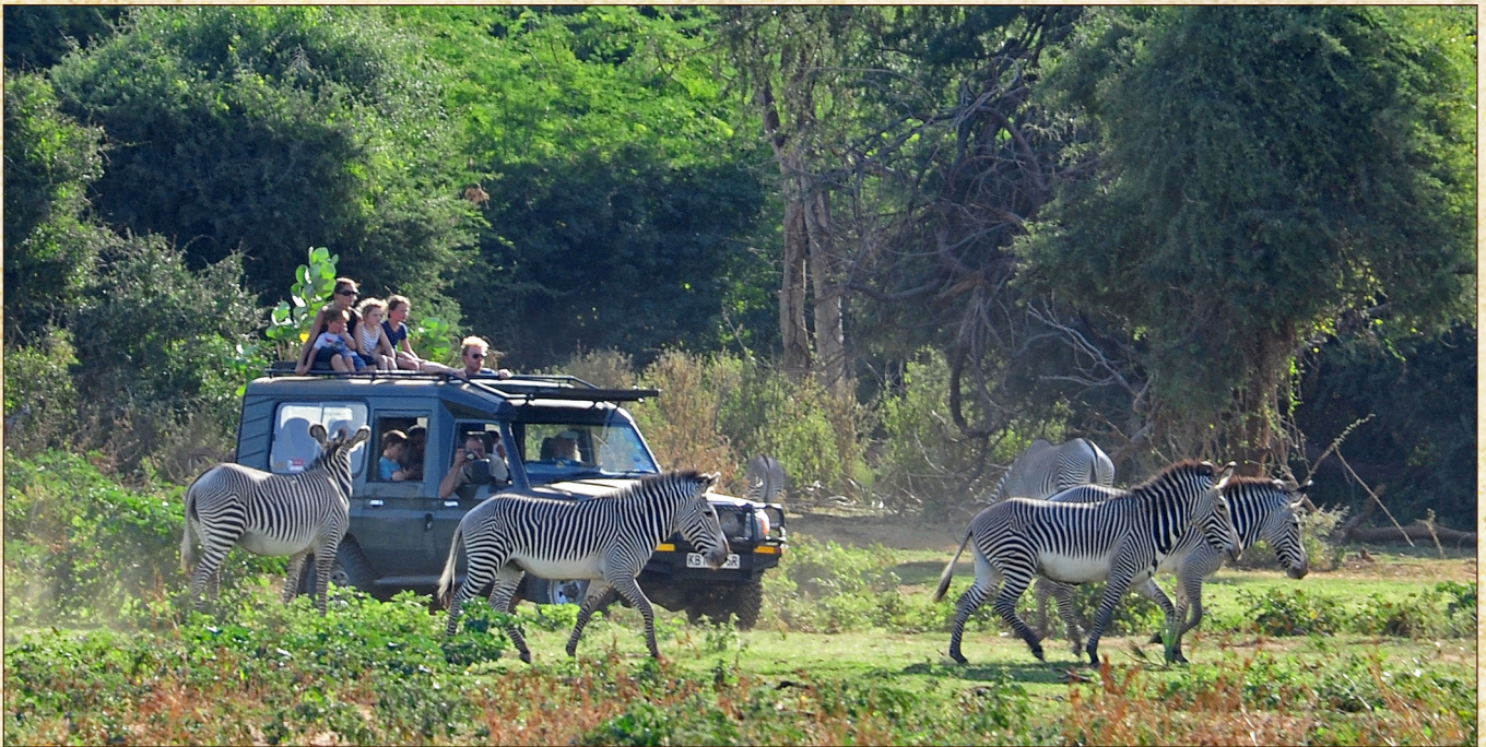
Game drive, Equus Grevyi - Grevy's zebra - Punda milia, Samburu National Reserve

Dinner and overnight Samburu Intrepid or similar.