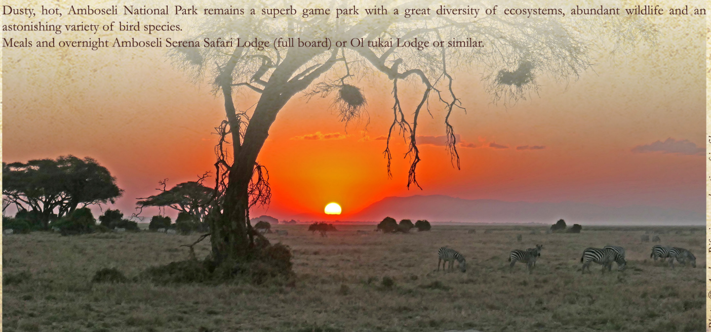
Sunset - Amboseli National Park

Meals and overnight Amboseli Serena Safari Lodge (full board) or Ol tukai Lodge or similar.