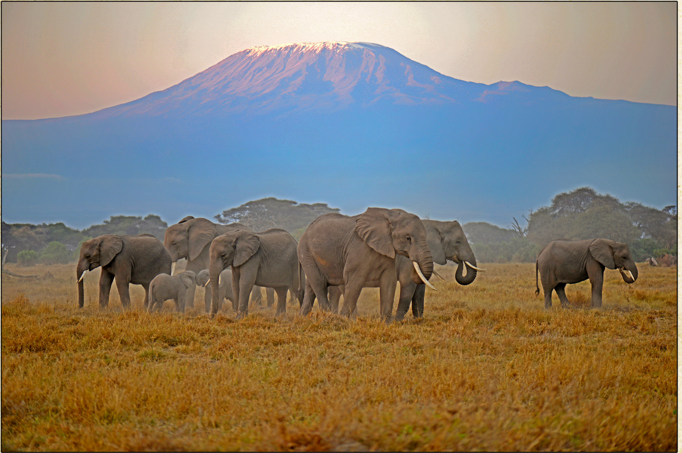
Loxodonta africana - African Elephant - Tembo - Amboseli National Park

Amboseli National Park , at the foot hills of Kilimanjaro, the highest mountain in Africa topping 5895m, is a spectacular back drop to a diversity of adjacent ecosystems: marsh and swamps, open plains and savannah, acacia woodlands and Lake Amboseli, sometimes a dry lake, sometimes a lake. Here, at times, you can see a herd of antelopes, or a majestic giraffe strolling across the lake, their shadows dissolving into a mirage battered by dust devils. The mesmerizing splendor of this strange almost barren landscape at moments seems to suit fine the rhythmic pace of a herd of elephant roaming from the swamps through the dry lake to small acacia thicket. This diversity of mini ecosystem is somehow a haven to hundreds of bird species as well as to mammals from big to tiny.