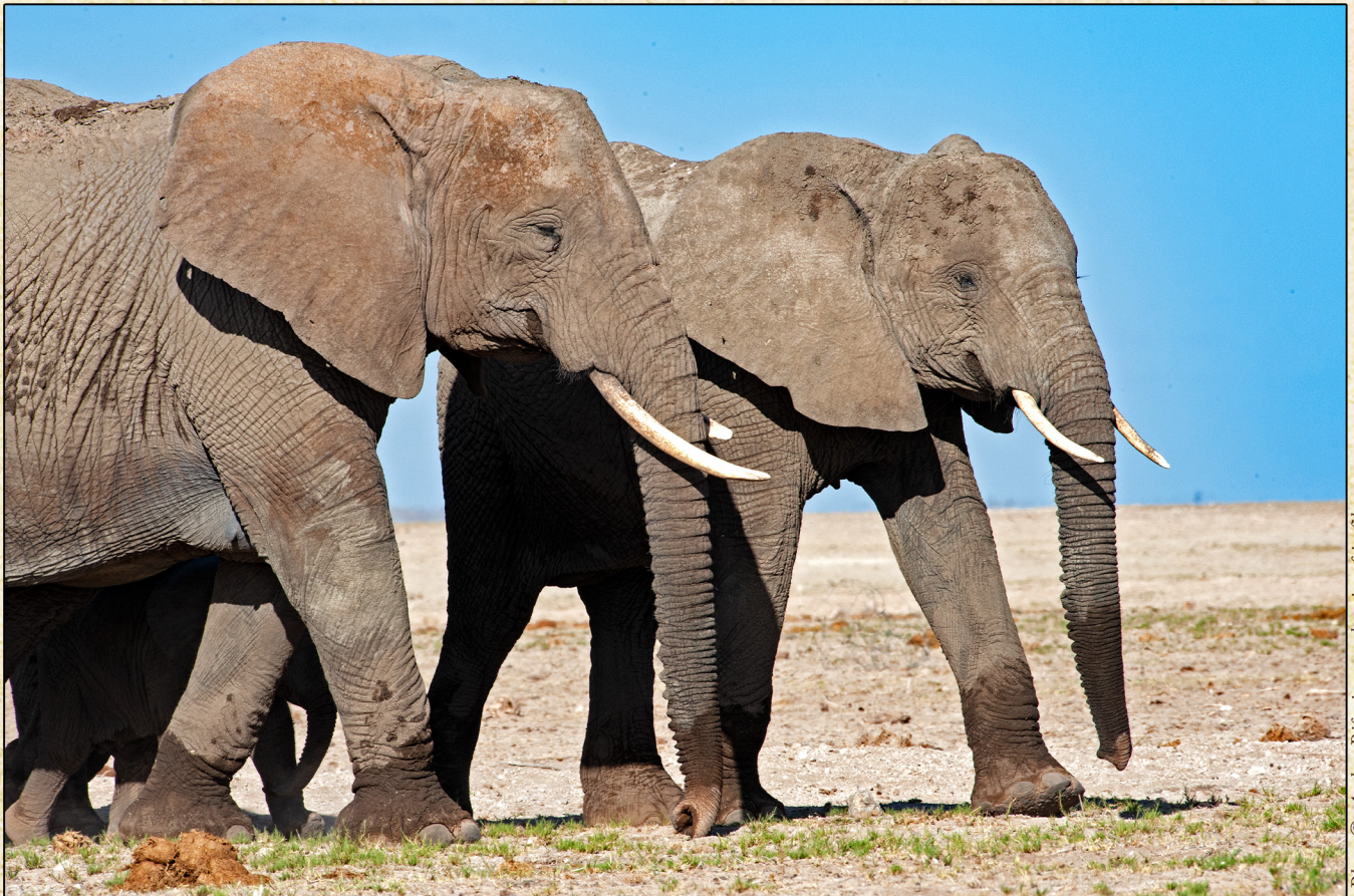
LoxodontaAfricana - African Elephant - Tembo - Amboseli National Park

Amboseli, Land of Giants - 3 days 2 nights