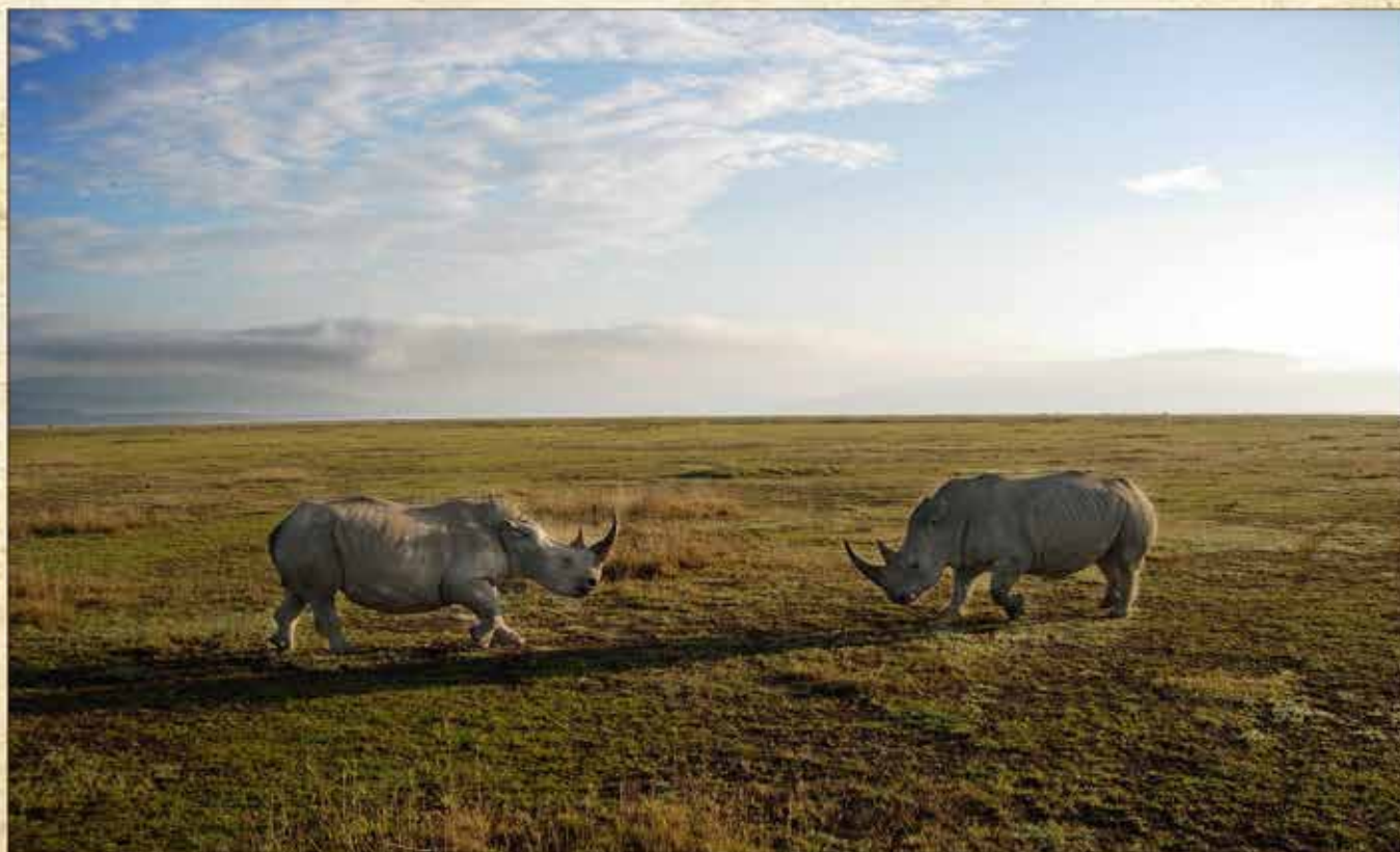
Rhinos, Lake Nakuru National Park

A morning drive to Lake Nakuru, famous for its spectacular birdlife – of flamingos, pelicans, cormorants, herons, grebes, and birds of prey. A veritable paradise for ornithologists, Lake Nakuru is also a good place to see large mammals – including Rhinoceroses both Black and White, African Buffaloes, and Rothschild's Giraffes. Lions too and Leopards are often seen, and large troops of Olive Baboons wander about look down from the cliffs towering over the park. This makes for a beautiful overnight stop. Dinner & Overnight Sarova Lion Hill or Similar.