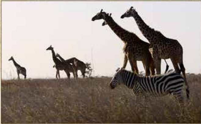
Nairobi National Park

Dinner & Overnight (DBB): Nairobi Tented Camp.