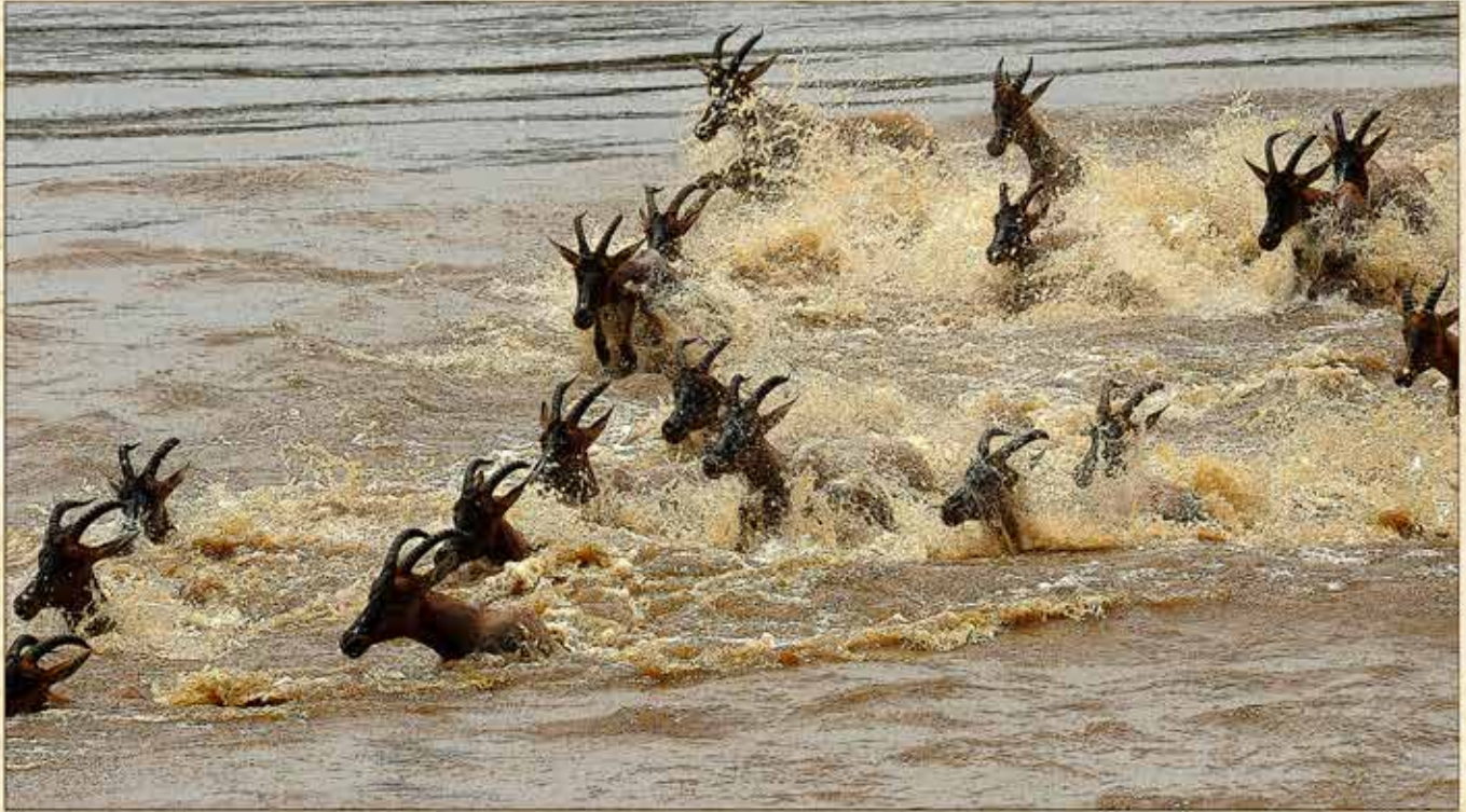
Topi crossing Mara River - Masai Mara

Today we drive up and over the Mau Escarpment, passing the Mau Forest to our west, to the bustling Masai capital Narok, before entering the vast plains and rolling hills of the Mara, arriving just in time for lunch. Each year, between June and November, hundreds of thousands of wildebeest and zebras from the southern plains in the Serengeti come to the northern plains of the Masai Mara in search of pasture. We may, depending on the season, get to see and to photograph or film these large herds on the move or crossing the Mara River. This is always a thrilling spectacle. Dinner & Overnight Mara Serena Safari Lodge.