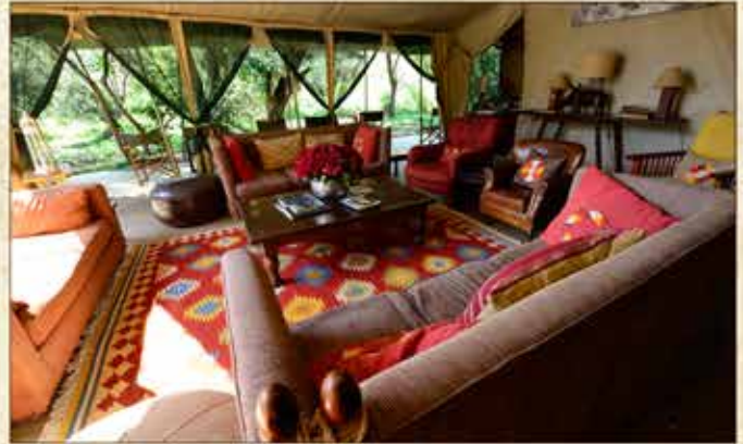
Nairobi Tented Camp